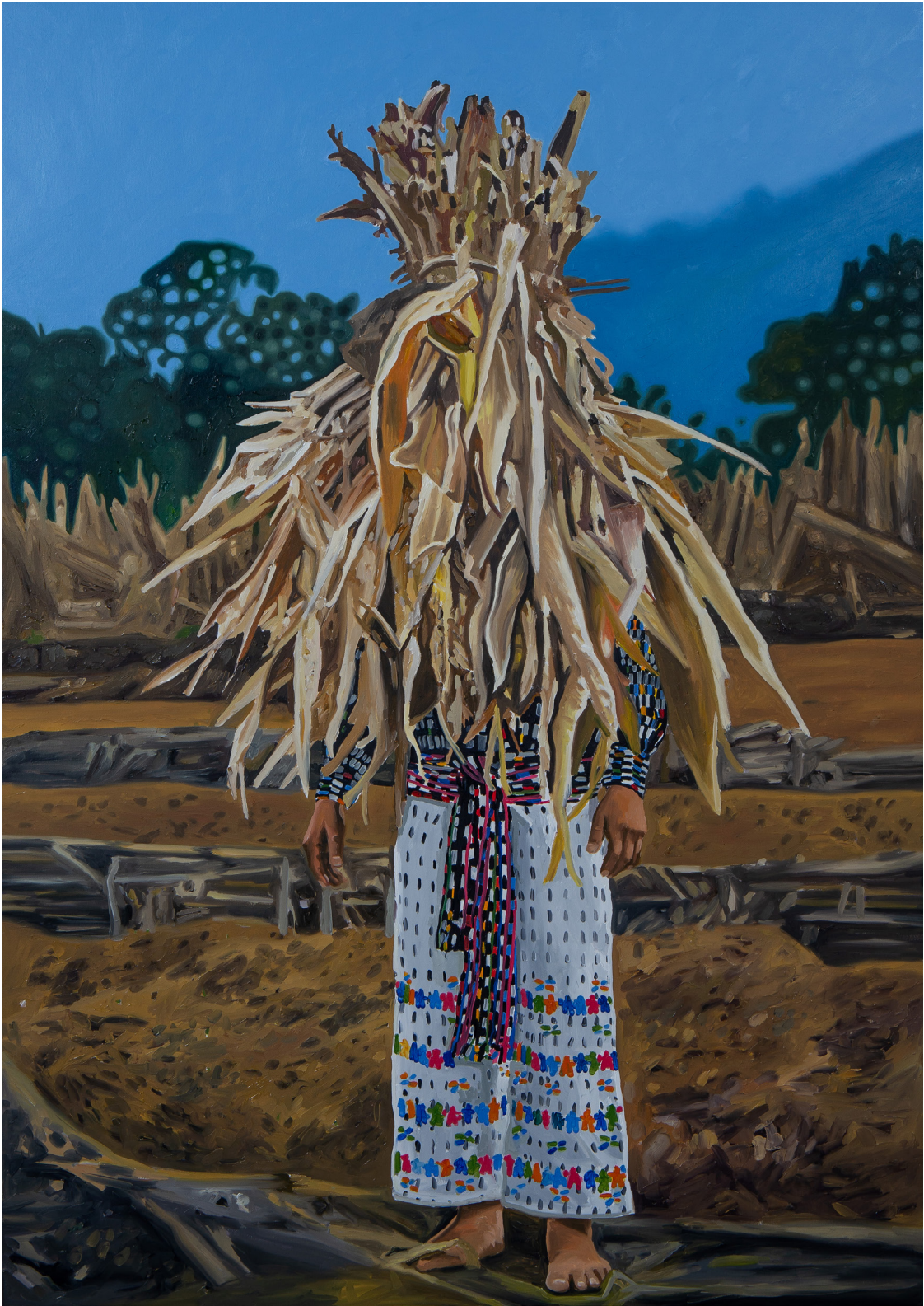
From the series Saq taq achik' : Sin título 2022 Oil on canvas 140 cm x 100 cm