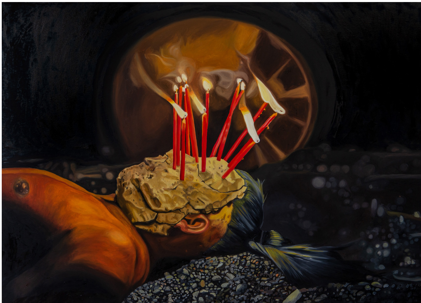
From the series Saq taq achik' : Sin título 2022 Oil on canvas 100 cm x 140 cm