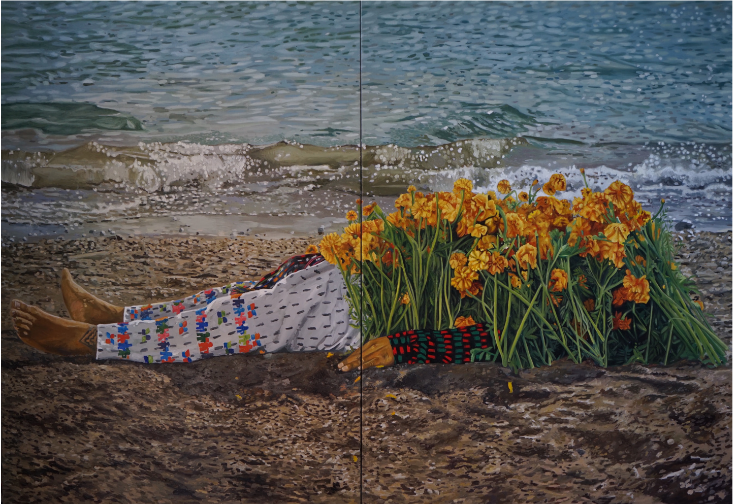
From the series Saq taq achik' : Sin título 2023 Oil on canvas 140 cm x 200 cm