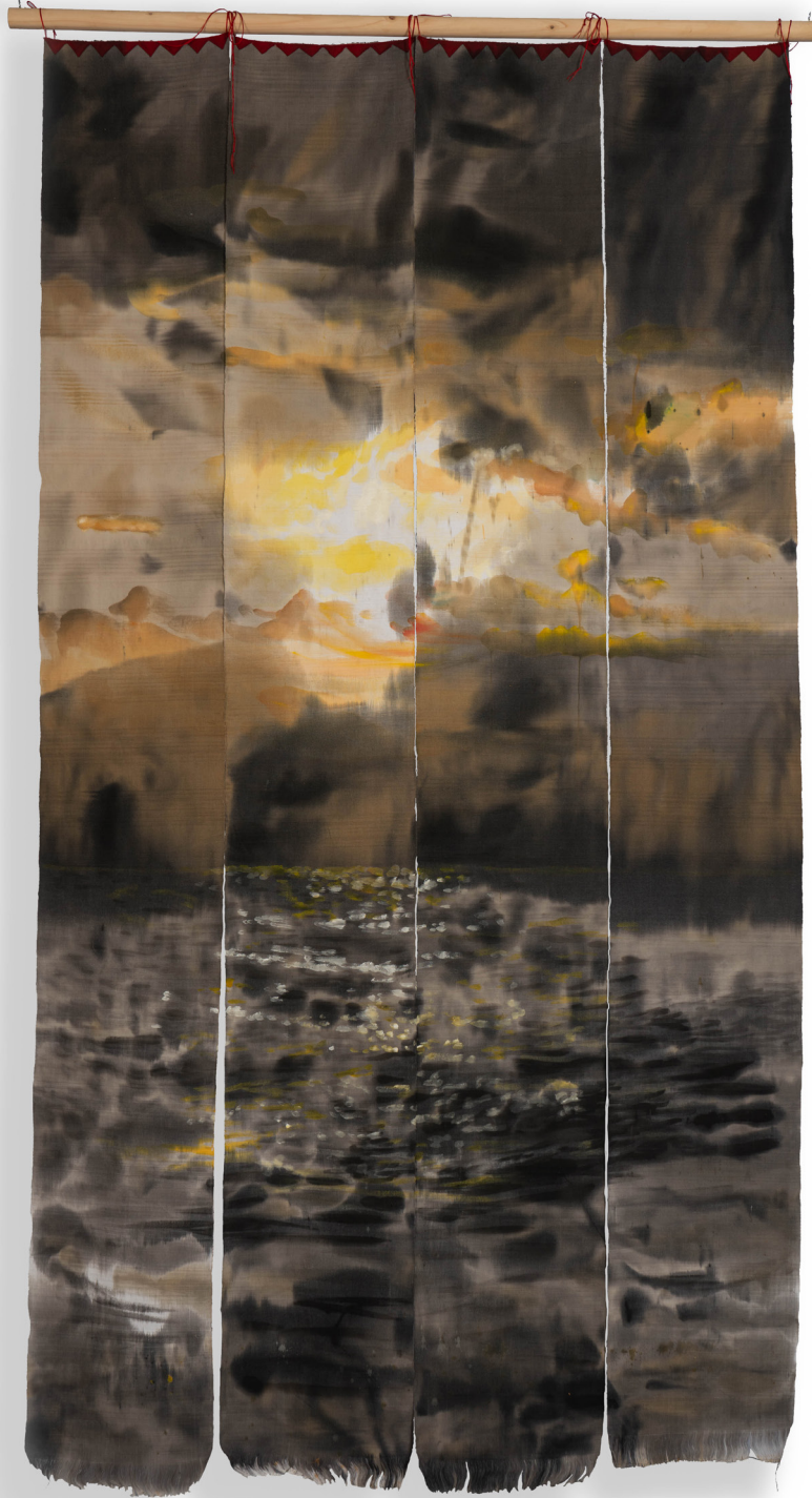
From the series K'o q'iiij ne t'i'lto' ja juyu' t'aaq'ajj': iq' / aire del norte 2024 K'oxaaj (waist loom) cotton thread weave, acrylic, and burnt motor oil 281 cm x 149 cm